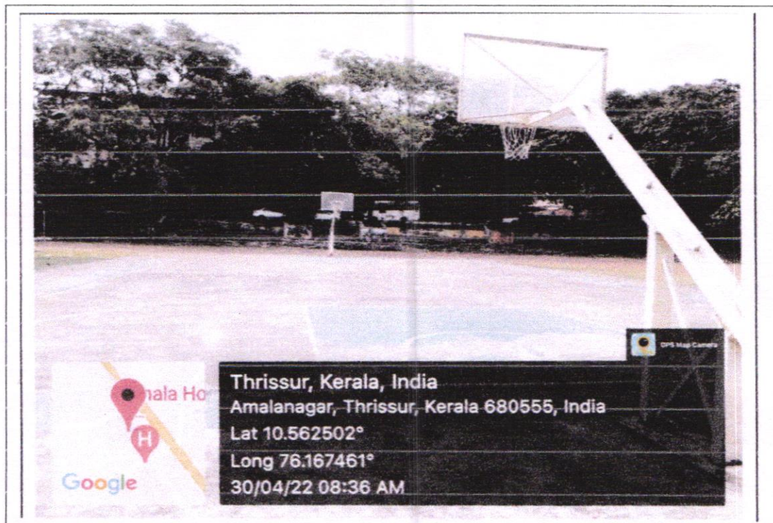
ACON, BASKET BALL CORT

Affiliated to Kerala University of Health Sciences and recognized by Kerala Nurses and Midwives Council & Indian Nursing Council (Certificate No. 18-16/2893-INC)