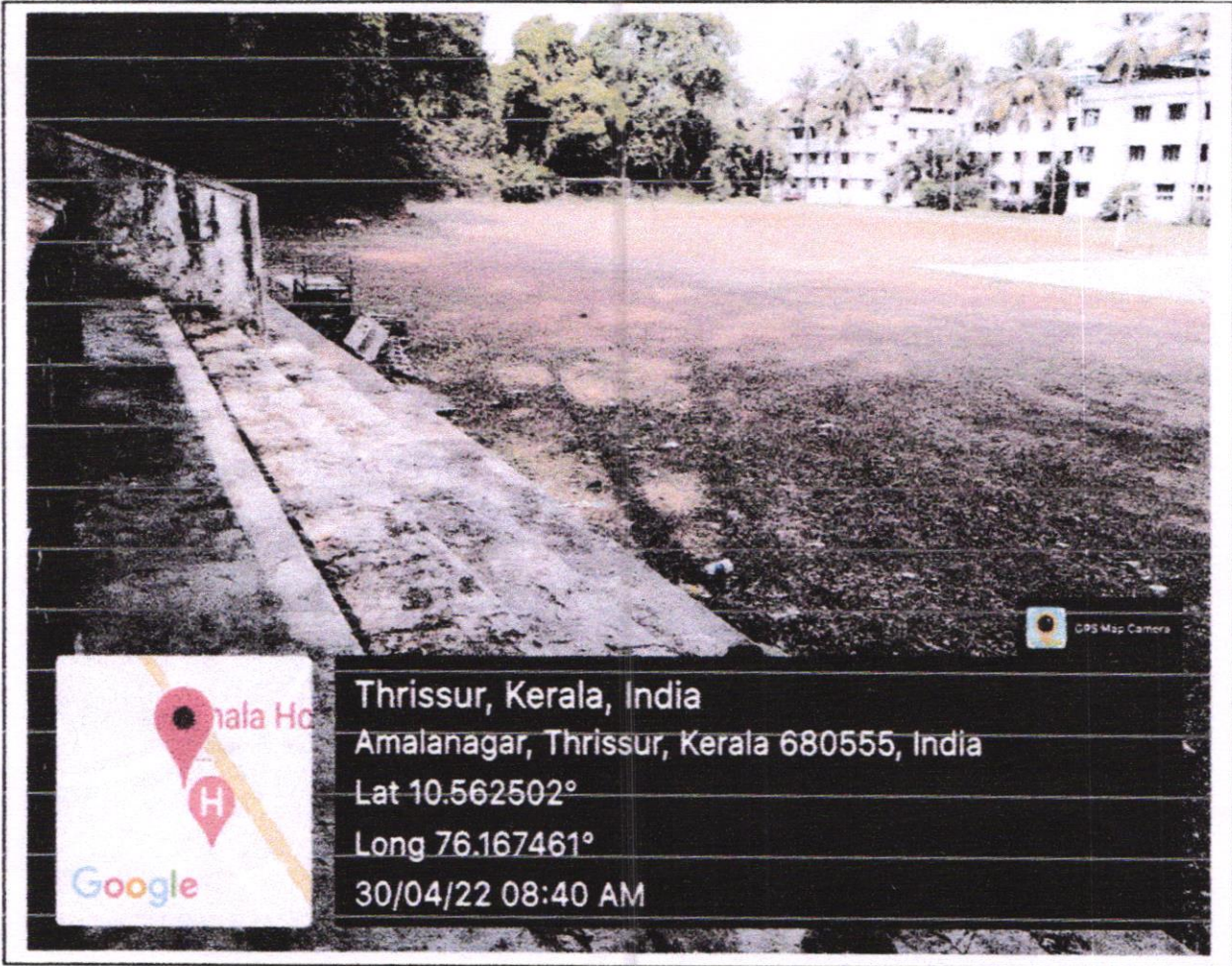
ACON, FOOT BALL GROUND

Affiliated to Kerala University of Health Sciences and recognized by Kerala Nurses and Midwives Council & Indian Nursing Council (Certificate No. 18-16/2893-INC)