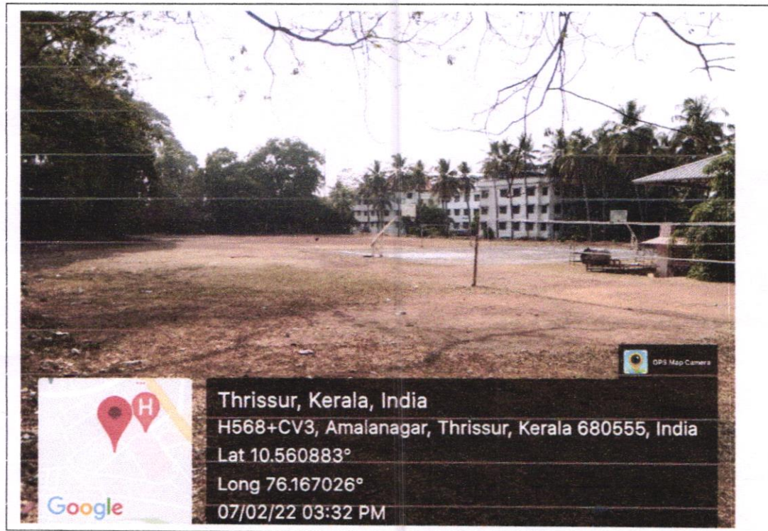
ACON, PLAY GROUND

Affiliated to Kerala University of Health Sciences and recognized by Kerala Nurses and Midwives Council & Indian Nursing Council (Certificate No. 18-16/2893-INC)