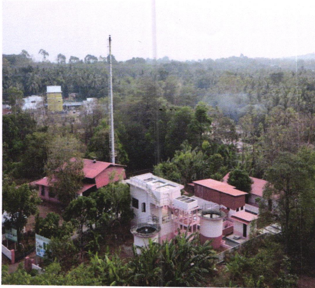
ACON, WASTE WATER TREATMENT PLANT

Affiliated to Kerala University of Health Sciences and recognized by Kerala Nurses and Midwives Council & Indian Nursing Council (Certificate No. 18-16/2893-INC)