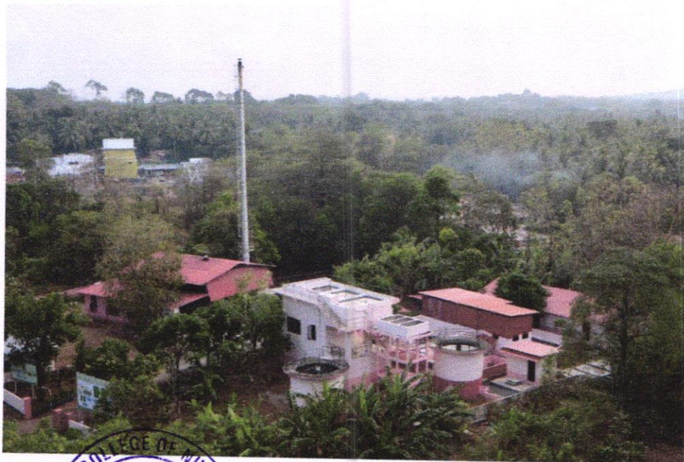
ACON waste water recycling plant and bio medical waste management plant