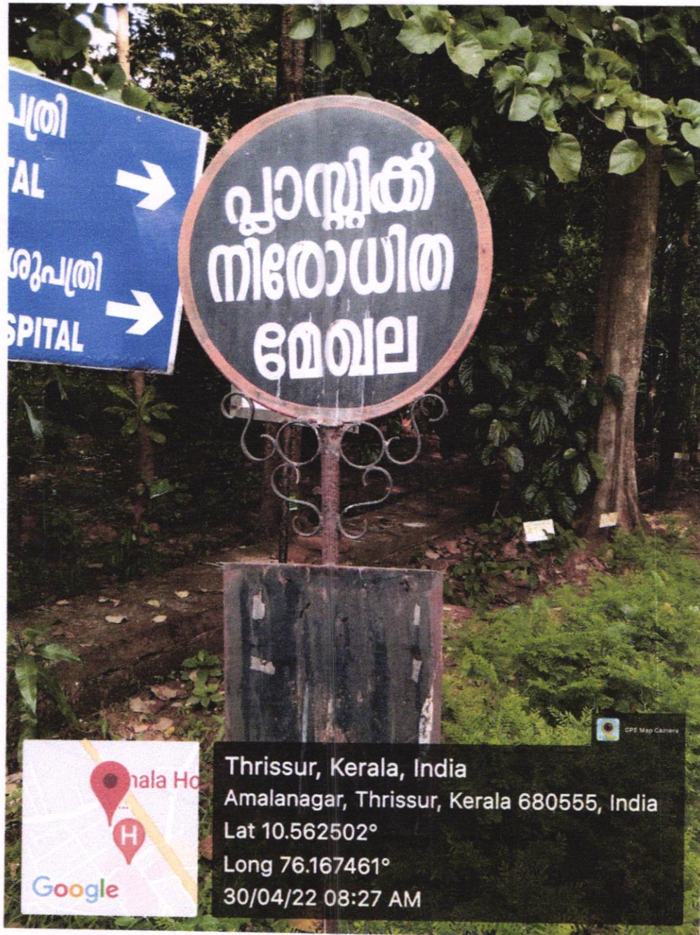
ACON, SIGN BOARD SHOWING 'BAN ON USE OF PLASTIC' IN MALAYALAM, NEAR TO THE COLLEGE